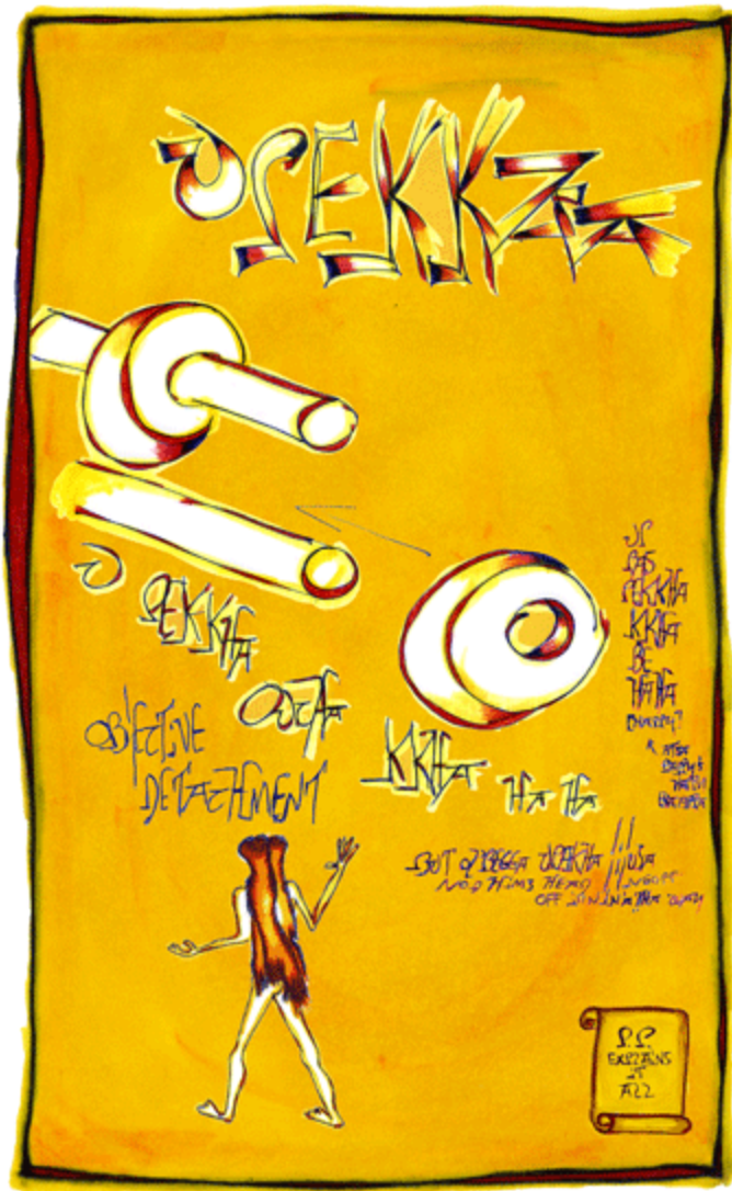
(Illustration of a wood pecker)

[6] This is my own terminology. For the discussion of it's use this way see: The 10th Question, Samma Vijja, Note on Terminology , where I have substituted vijja and upekkha for nana and vimutti.